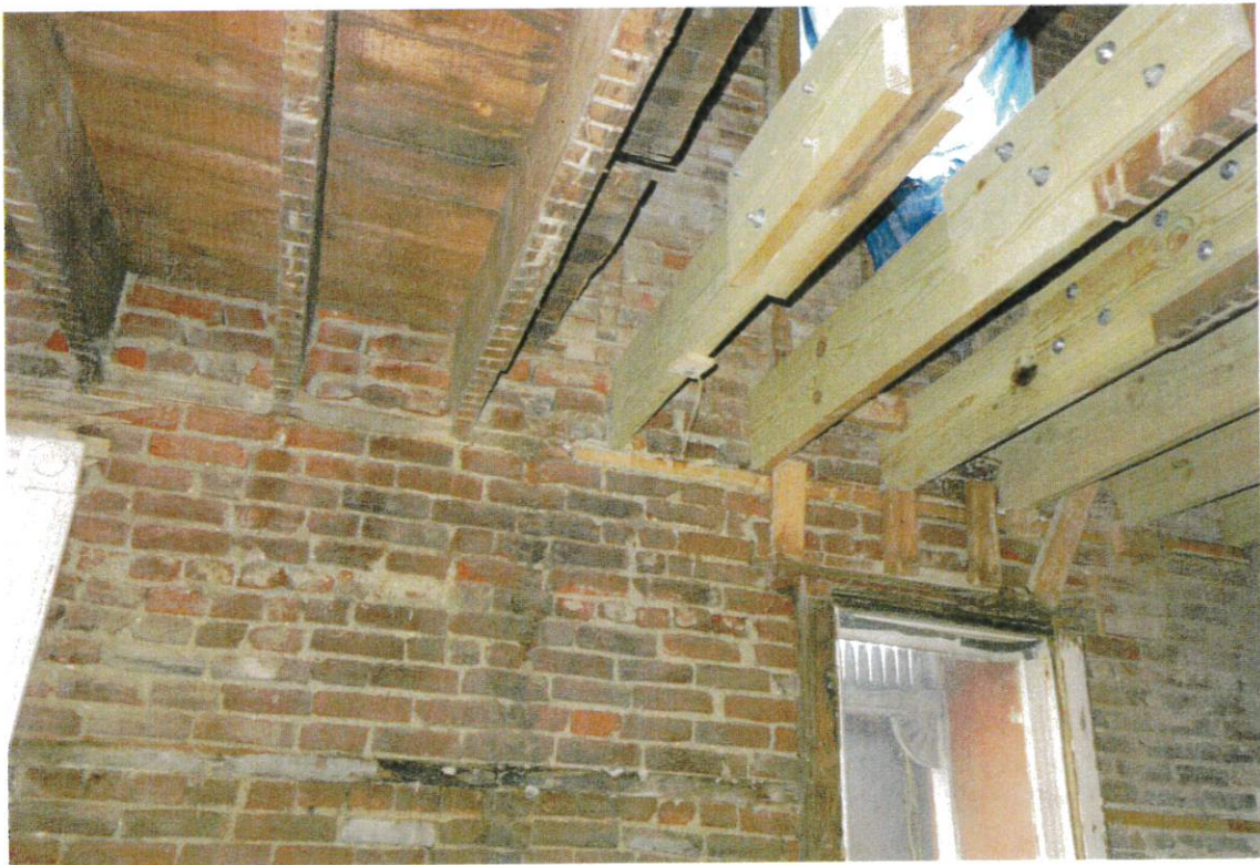
Rear property view