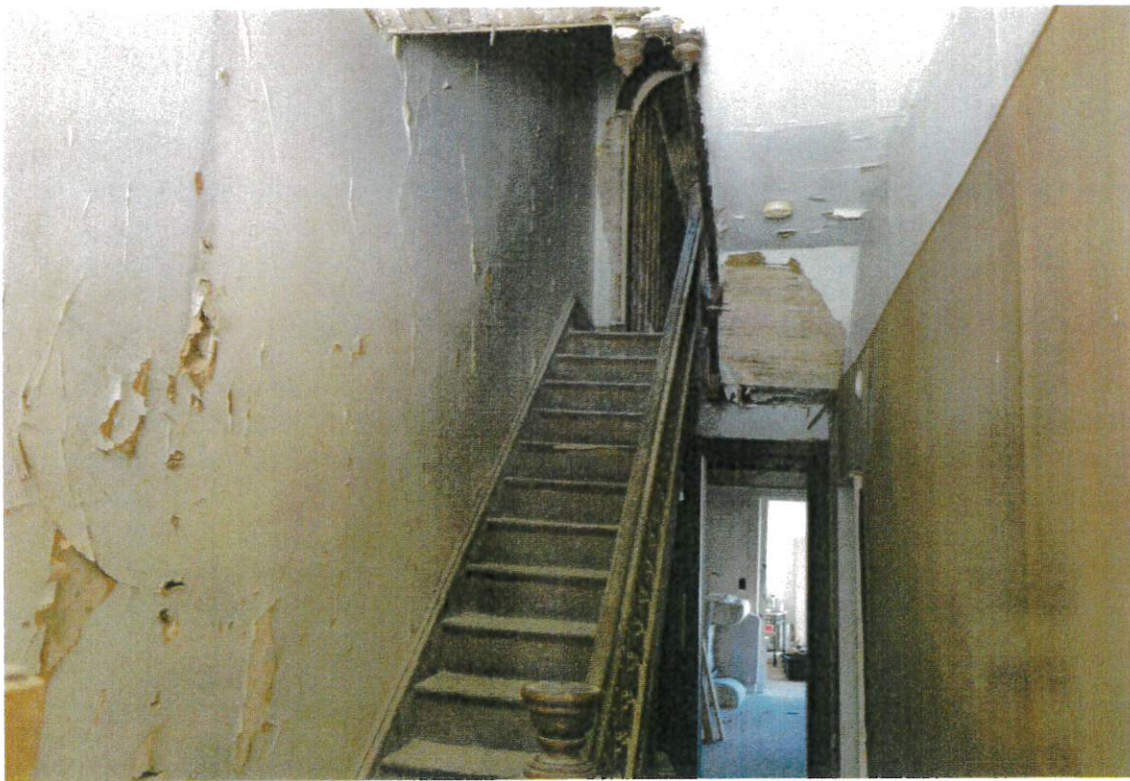
Front interior view