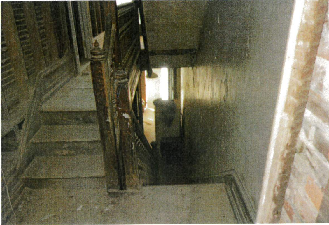
Second floor interior view