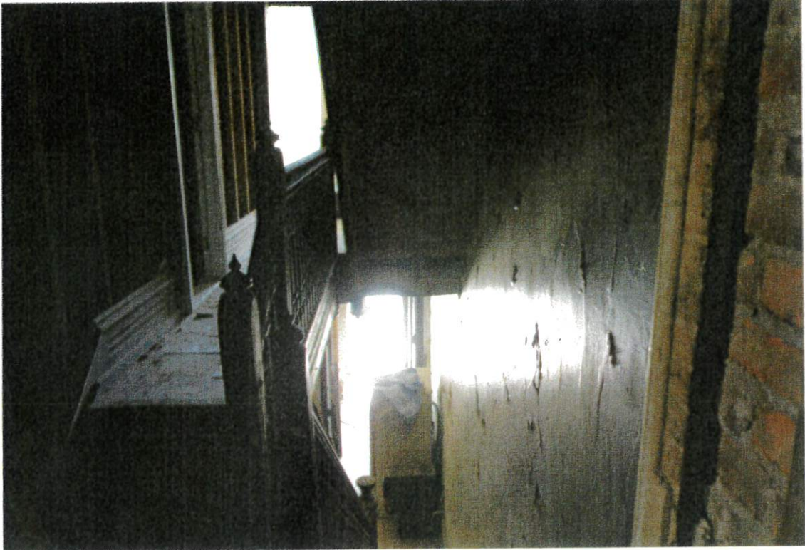
Second floor interior view