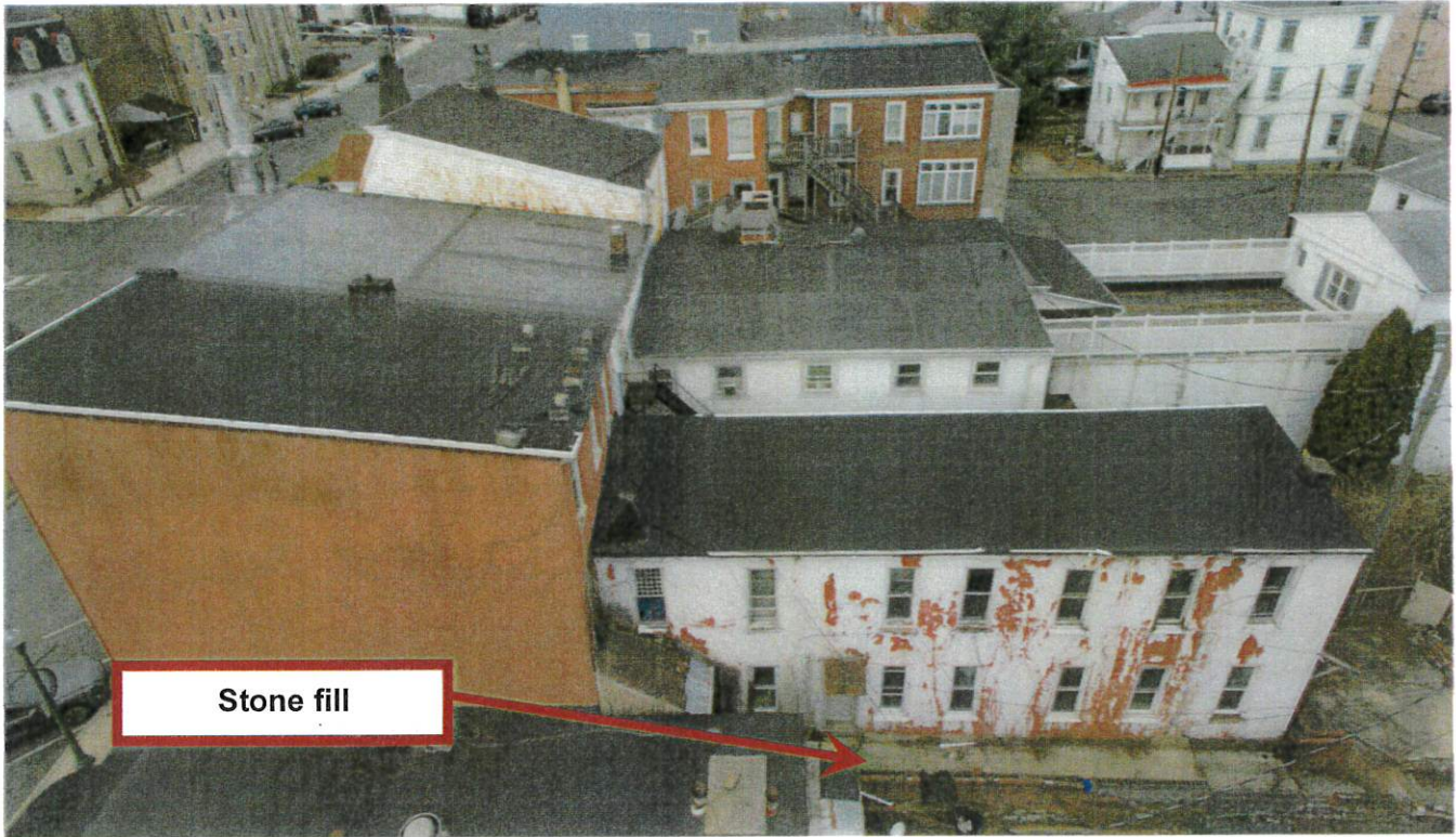
Arial view showing that the front is structurally sound but the rear should be demolished