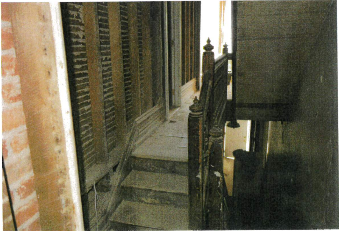
Second floor interior view